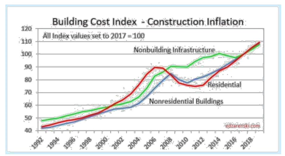
Figure 2: Construction inflation

Construction costs continue to rise across Northern Ireland with the greatest impact being on higher density developments – the primary delivery method within the City Centre. Most developers price City Centre construction at approximately £150 per built sq. ft. As can be seen in figure 2 below, construction costs for residential development have risen consistently since 2012.