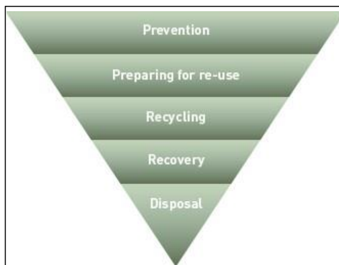
Figure 1: Waste Hierarchy