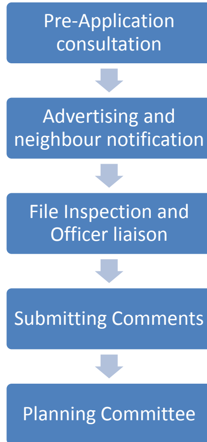
Fig.2 Community Involvement in Development Management